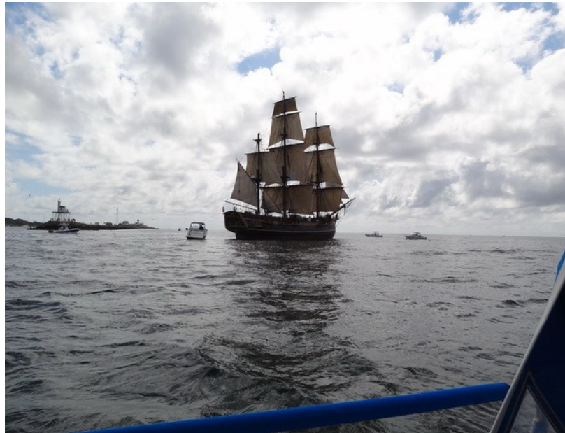
The HMS Bounty leaving Gloucester Harbor Summer, 2012